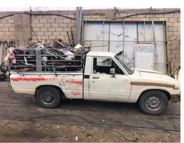
GIZ / Al-Tawaha