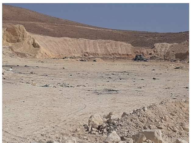
GIZ / Al-Tawaha

The Petra Region Authority through its staff takes over the responsibility of collecting and transporting waste from residential areas and the tourism areas to the landfill in "Bastah" where the waste is landfilled directly without any sorting or processing. All waste transported from the different areas is landfilled.