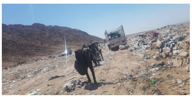
Eng. Samih Abu Amreih

The workers are always granted 30 minutes to sort the waste from each vehicle that comes to the landfill. All workers are males and of Jordanian nationality and the number of workers is 20-25 persons usually, you will find one-third of them at the same time in the landfill area. The monthly income is different and for those who have pick-ups they may gain 350-450 JD excluding fuel prices, and the others may gain 100-150 JD. The ages of the workers vary from 19-61 years and some of them had previous judicial issues.