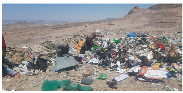
Eng. Samih Abu Amreih

• Waste workers own vehicles (usually pick-ups) and they usually work independently or with other persons and they used to collect waste or scraps directly from the containers or from the markets and in front of the houses. Some of the vehicles have loudspeakers calling for scraps. They buy the scraps at very low prices from