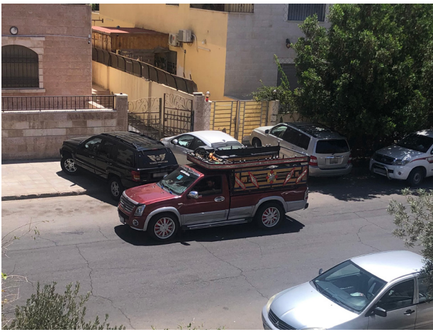
GIZ / Al-Tawaha