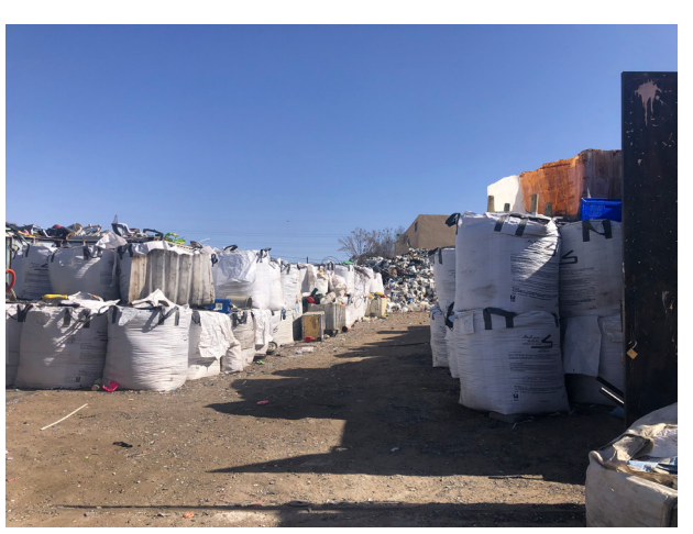
GIZ / Al-Tawaha