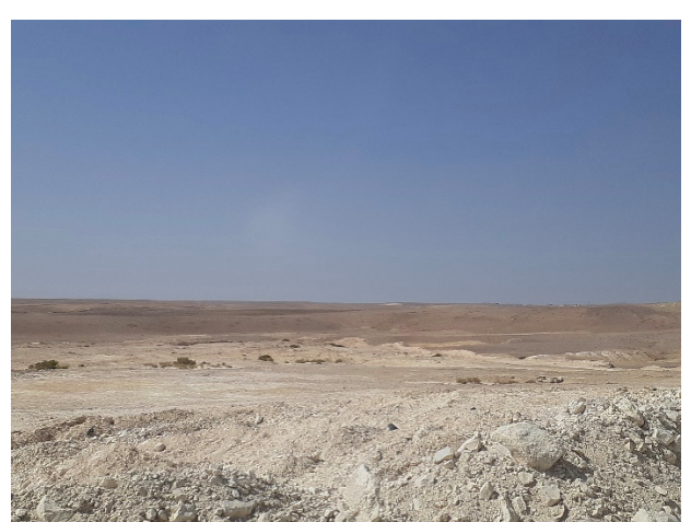
GIZ / Al-Tawaha

Petra Region Authority is the responsible party for all activities within the region boundaries through the council of commissioners and its different directorates and by the special law of Petra Tourism and Develop-