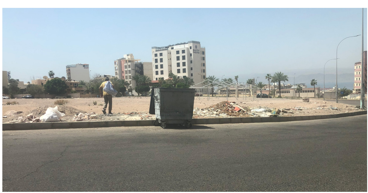
GIZ / Al-Tawaha

The scavengers search in the waste containers usually available in the residential areas which have a lot of activities such as the 3rd, 5th and 8th residential areas, Cornish Street. Due to the high number of visitors and restaurants in the Cornish street we will find a lot of scavengers searching the waste containers for the metal cans. The scavengers are active in the middle of the nights and early in the morning, some of them have salaries from the Ministry of Social Development and some of them are retired people but their salaries do not cover their needs. The monthly profit of scavengers is estimated between 100-200 JD and it depends on the quantity and the value of the collected materials. In general, their financial affairs are very bad. There is a problem related to the control of the prices of packaging materials such as metal cans, plastic and cartoons. The scavengers usually look for the metal cans, plastic materials and cartoons because of their high prices. Through the meetings and the tours, we discovered that some people collect and sell materials of high price but not regularly.