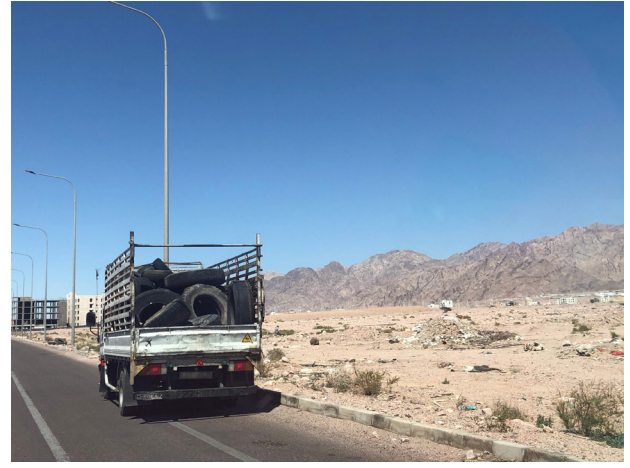
GIZ / Al-Tawaha