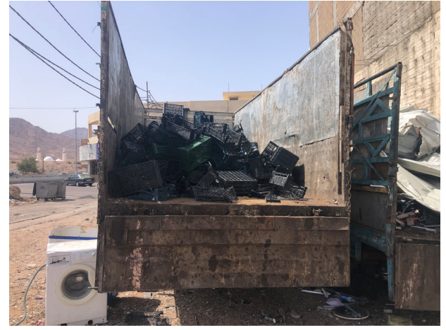
GIZ / Al-Tawaha