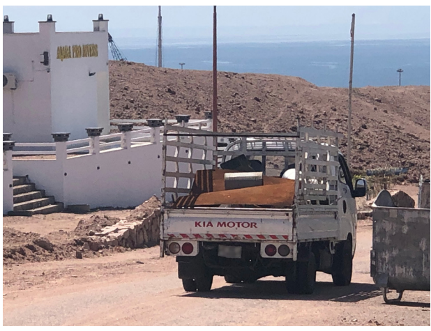
GIZ / Al-Tawaha

the residential areas and all of them are of Jordanian nationality and they are all males except one lady. The number of vehicles in Aqaba city is about 50 where 10 of them are owned by residents of Aqaba and the rest from other governorates. The income of each is 400-450JD excluding the fuel costs.